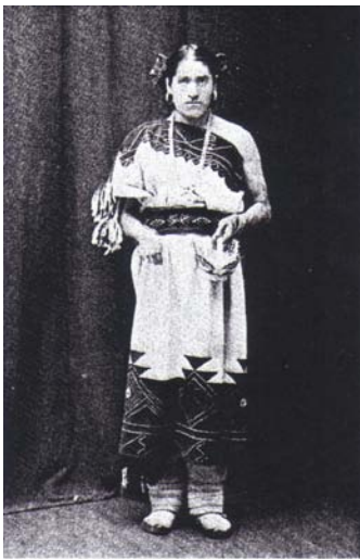
4. Whewha of the Zuni people.

There are many examples of Two Spirit Transgender Women of the past because the male anthropologists were interested in them. Whewha of the Zuni people is both famous in her lifetime, and in modern times as she continues to gain fame leaving a legacy of a life lived as a woman and a role model. Osh-Tisch is another famous Two Spirit Transgender Woman who was Crow and lived in the 1800's. She was a famous artisan and trader.