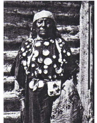
5. Osh-Tisch of the Crow People

Transgender women today have a difficult road to follow because most Aboriginal people have forgotten our cultural histories due to residential schools. They experience homophobia and transphobia in their families and communities. There are a few who are understood and protected by their families. As more and more Aboriginal people learn our histories, Transgender Women will take their place in our communities and live as they are meant to among us with dignity and respect.