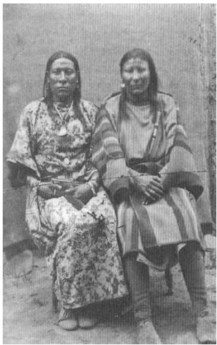
1. Osch-Tisch and the Other Magpie

We are currently searching for who we were before the influence of non-Aboriginal culture as Two Spirit Women. Not so that we can change and become that again – it would be impossible in our daily lives without the old culture to support it – but so that we can know the three things that contribute to our identity today: first, blood memory of who we are, and hearing stories of our past will be a direct link to that; second, knowing our colonization as it continues to shape our lives through the world and country that we live in; and third, our personal experiences that have and continue to shape who we are. All three things help shape our identity whether we know it or not, and learning as much about our past and history gives us an understanding of how our families have come to be the way they are and where we fit in the fabric of our communities - whether that experience has been in our communities, away from our communities, with family or not. Everyone's personal experience is individual and it is our unique experiences that make our community stronger when we come together.